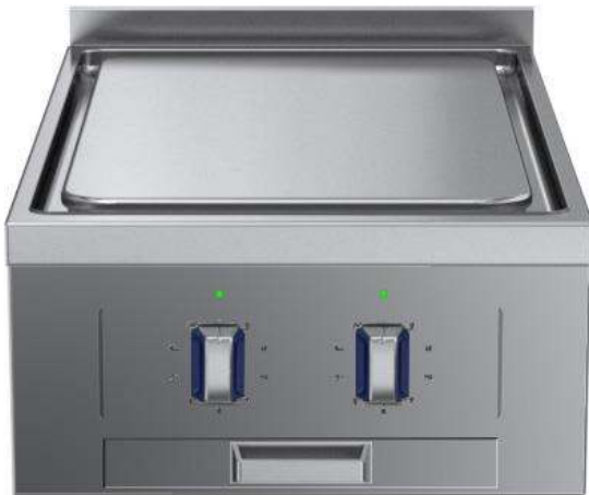
588501 (MBLBBEOAO) Electric Solid Top, 2 zones, ecoTop coating, one-side operated with backsplash